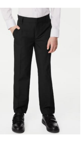
Regular leg acceptable