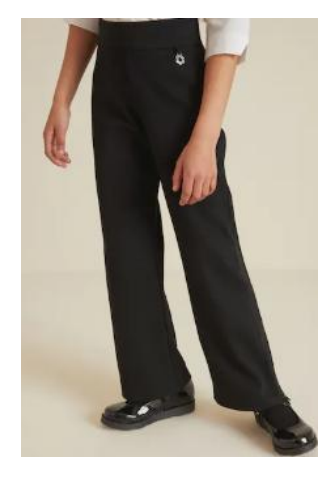
Boot cut acceptable