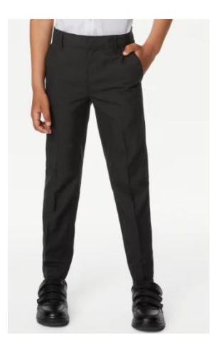
Slim fit acceptable